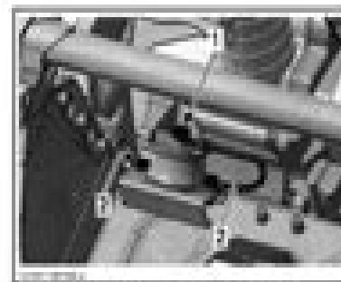
REAR ENGINE SUPPORT