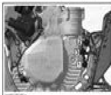
FRONT ENGINE SUPPORT