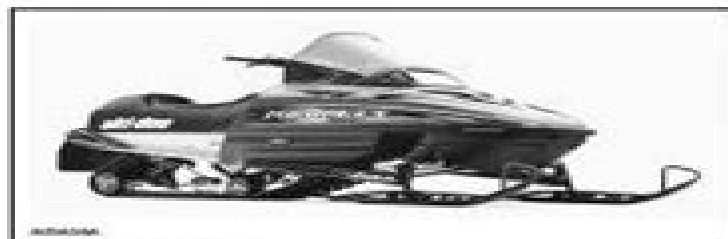
TYPICAL — S-SERIES