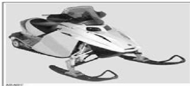
TYPICAL — REV SERIES