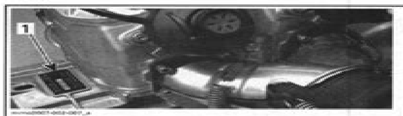
TYPICAL — 500SS AND 600 HO SDI ENGINES 1. Engine serial number